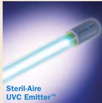
Steril-Aire UVC Emitter™

When you use UVC light to control IAQ and mold, output is all-important. Higher output provides the necessary “killing power” over a longer time.