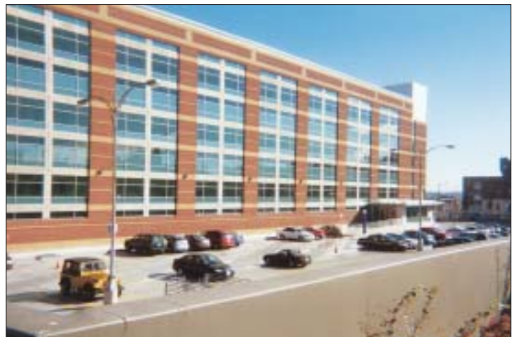
TOP: Maintenance worker Ike Franco shows some of the Steril-Aire UVC lamps installed opposite the cooling coils in the Tacoma Jail's air-handling units. ABOVE: Correctional facilities' dense inmate population raises risks of outbreaks, such as TB, HIV, hepatitis, asthma, and antibiotic-resistant staph.

According to the BOP, "certain risks and conditions, such as HIV infection, diabetes, chronic renal failure, injection drug use history, and close contact with someone who is sick with infectious TB, all pose a greater risk for getting TB disease."